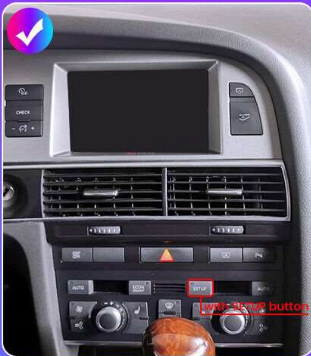
Für Audi A6 C6 4F Niedrige Version MMI 2G (2005-2009)

Bitte bestätigen Sie das Baujahr Ihres Fahrzeugs vor der Bestellung, wenn Ihr Fahrzeug von 2010-2012 ist, kontaktieren Sie uns bitte, um eine andere Version zu bestellen.