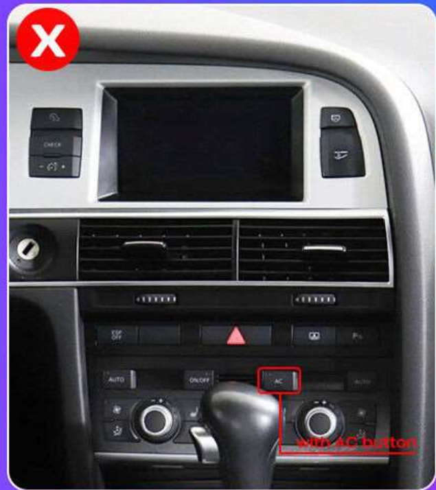
Für Audi A6 C6 4F Hohe Version MMI 3G (2010-2012)