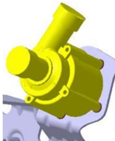
Figure 2. Pump mounted.

Bleed the coolant circuit according to ElsaPro at Repair Manual >> Engine >> 19 Cooling System >> Cooling System/Coolant >> Cooling, Draining and Filling .