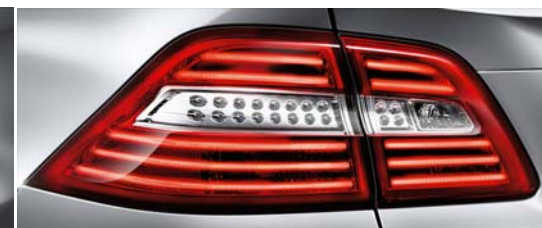
LED daytime running lamps and tail lamps