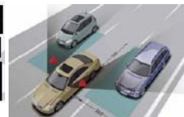
Active Lane Keeping Assist