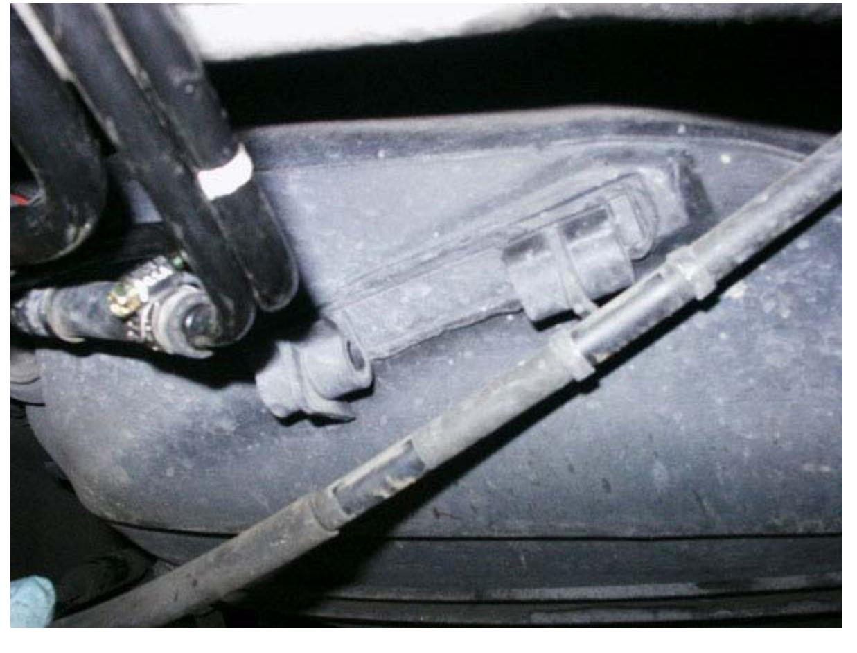
*STEP 3* Using a pry bar or something like it GENTLY pry the front of the gas tank down enough to slip a 2x4 up and kind of on top of the tank. this will hold the tank in the downward position.

Disconnect the cable from the front of the tank. There are 2 plastic clips on the tank.