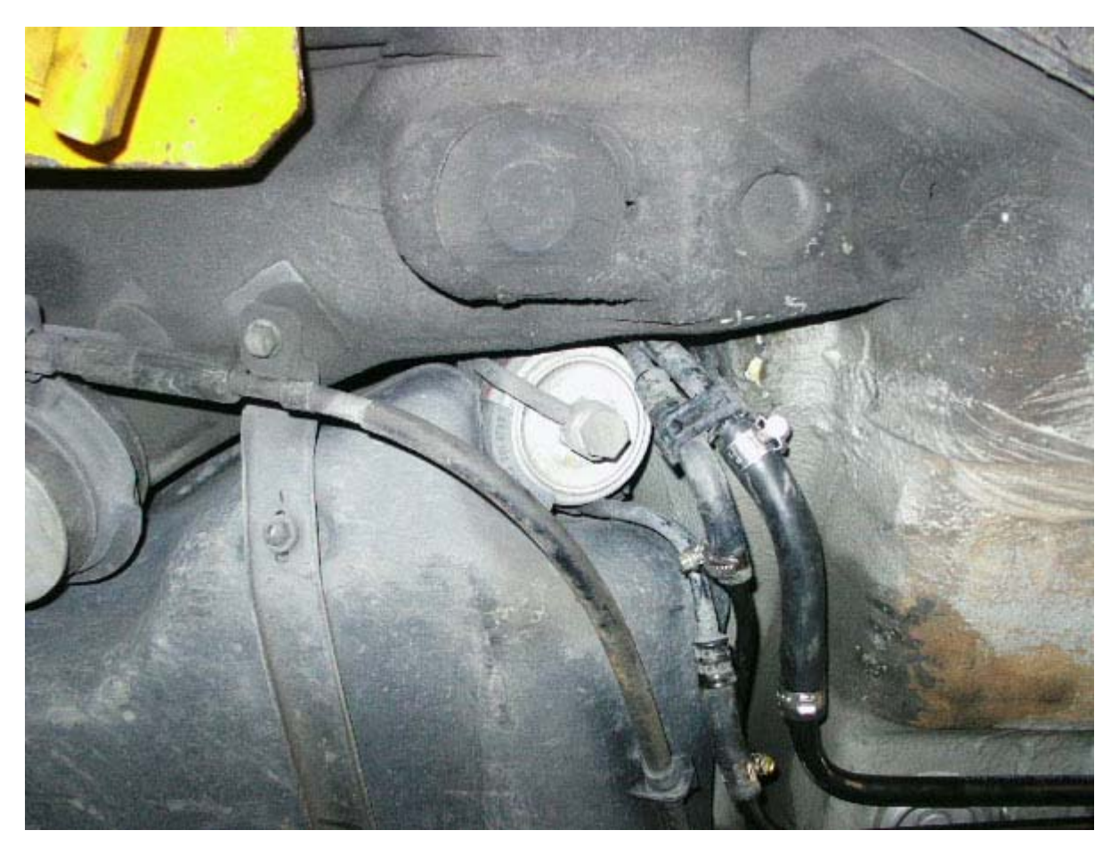
*STEP 1* There are 4 13mm bolts that hold the tank straps to the body. remove them. No

The fuel filter is located on the passengers side, rear of the car on the front/side of the fuel tank. (see photo)