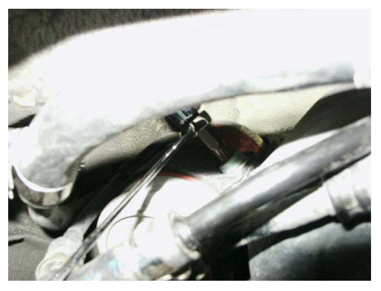
*STEP 5* Remove the lower banjo bolt attaching the fuel line to the filter. 19mm socket. CAUTION: THE FUEL SYSTEM MAY BE UNDER PRESSURE AND FUEL WILL SPRAY OUT AND LEAK FOR A MINUTE WHEN YOU LOOSEN THIS BOLT (MAYBE A PINT OF FUEL). HAVE RAGS HANDY. Pull the line out of the way.