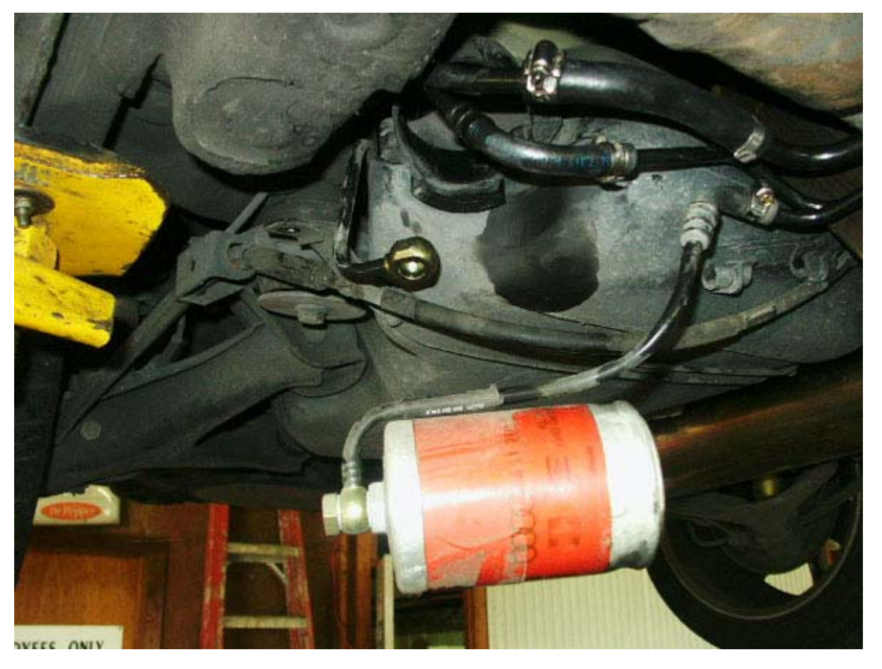
*STEP 7* Make sure to replace the sealing washers when you replace the filter. Your local dealer SHOULD have them in stock. Replace filter in reverse order!